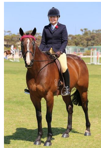
"Display" at Kimba Show 2014